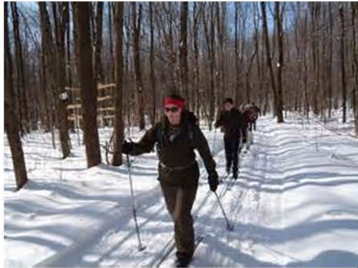
CLASSIC CROSS COUNTRY SKIING -20' WIDE TRAIL THAT ACCOMMODATES DUAL CLASSIC TRACKS AND NORDIC SKATING -4.6 MILES OF TRAILS -MULTIPLE TRAILS AND LOOPS