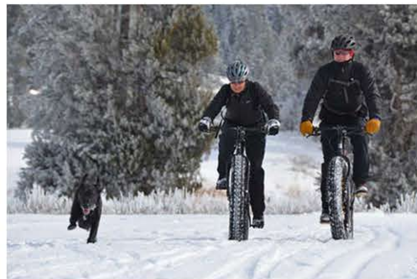
FAT TIRE BIKING -SHARED USE WITH MOUNTAIN BIKE TRAILS -8.1 MILES OF TRAILS -MULTIPLE TRAILS AND LOOPS