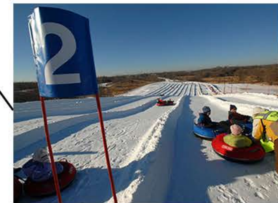
SNOW TUBING -APPROXIMATE SLOPE OF 18% -1000' LENGTH -12 - 13 LANES WIDE -MAGIC CARPET OR TOW ROPE