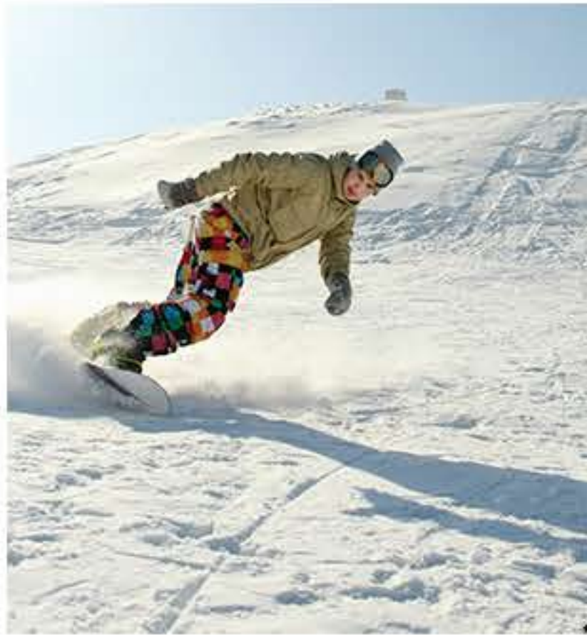
TERRAIN PARK -SLOPED AREA THAT ALLOWS SKIERS, SNOWBOARDERS AND SNOW-BIKERS TO PERFORM TRICKS -CONTAINS GNARLY JOBS (RAILS, BOXES, TABLE TOP, BARRELS, ETC.) AND RAD JUMPS (TABLE TOP, STEP-DOWN, STEP-UP, GAP, ETC). -SIZE APPROXIMATELY 5 ACRES