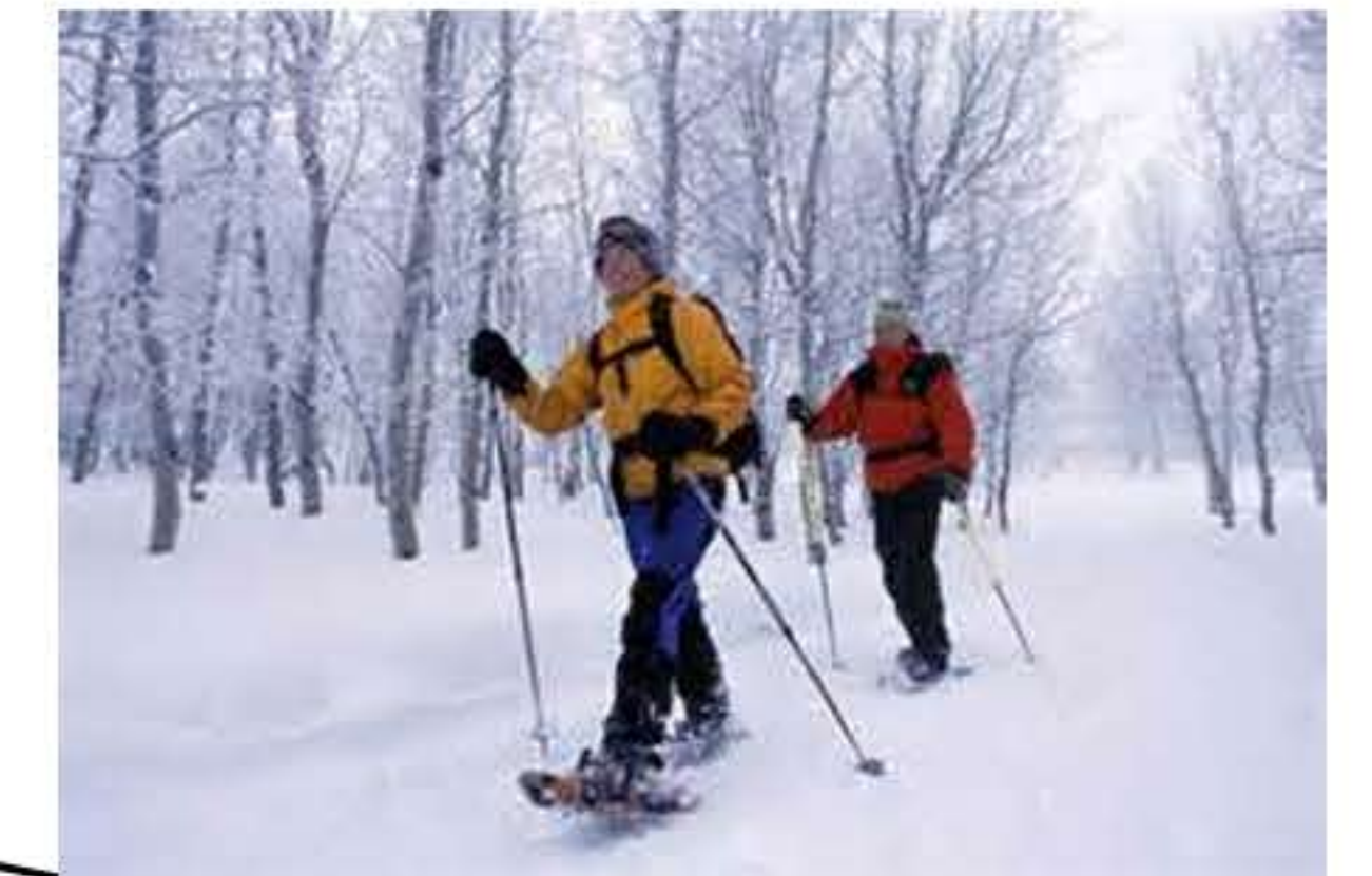
SNOW SHOEING -OFF TRAIL OPPORTUNITIES AND SHARED USE WITH MOUNTAIN BIKE TRAILS